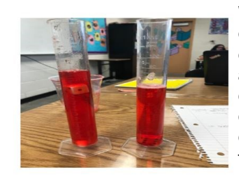
Here, we can see the viscosity visually